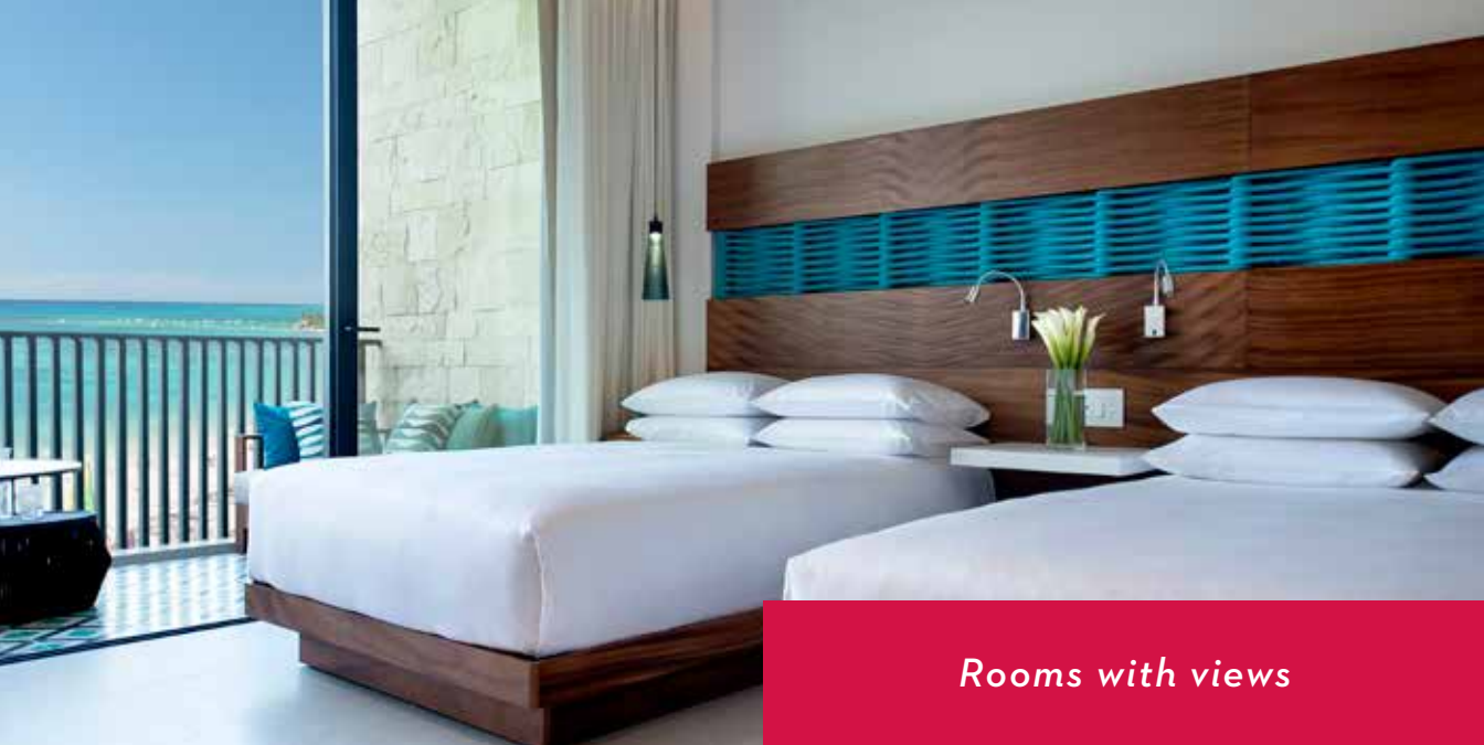
Rooms with views